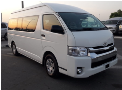
TOYOTA GRAND CABIN PAX < 10