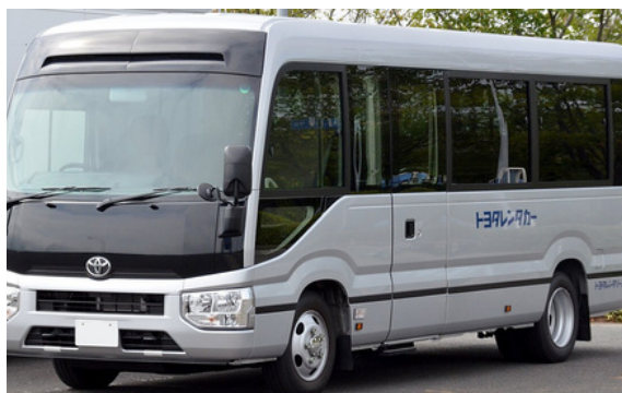
COASTER PAX > 10