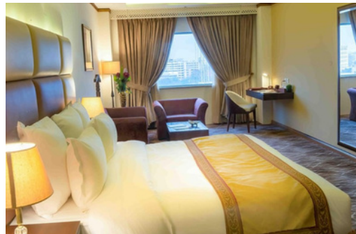
THREE STAR: LUXUS GRAND HOTEL LAHORE