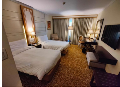
FIVE STAR: PEARL CONTINENTAL HOTEL LAHORE