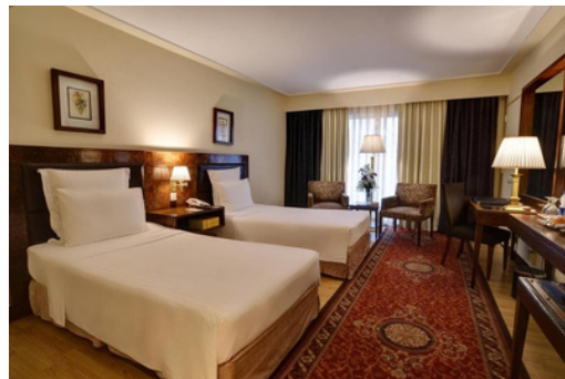
FIVE STAR: PEARL CONTINENTAL HOTEL RAWALPINDI