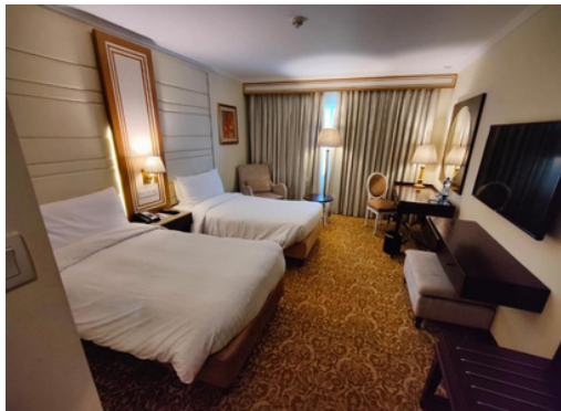
FIVE STAR: PEARL CONTINENTAL HOTEL LAHORE