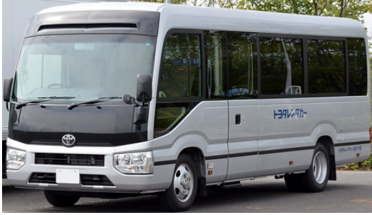
COASTER FOR GROUPS > 10 PERSONS