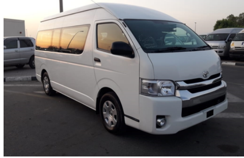
GRAND CABIN FOR GROUPS < 10 PERSONS