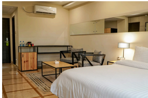
FOUR STAR: ROOMY SIGNATURE HOTEL ISLAMABAD