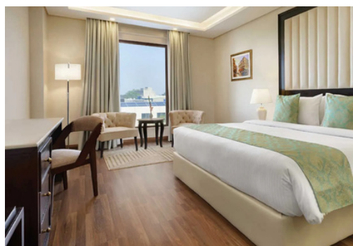
FOUR STAR: RAMADA HOTEL LAHORE